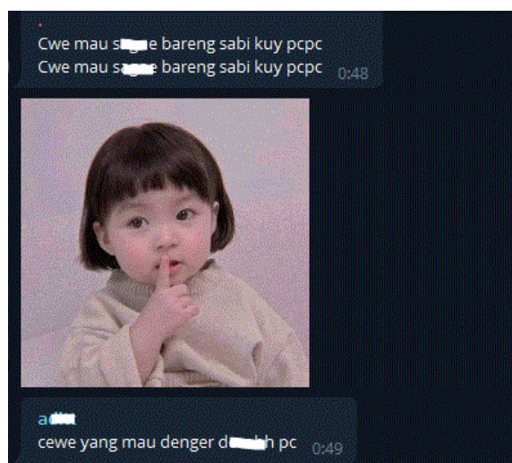
Figure 3. Perpetrators who want to offer & hear sighs from victims

Not only that, the perpetrators of acts of sexual harassment committed on social media telegrams often also offer to give their voices to the victims, which is a very inappropriate act when interacting, especially with strangers. Apart from these things, sometimes the perpetrators of acts of sexual harassment on Instagram often ask their victims to send their sighs or body parts, especially parts that are very private for victims who tend to be women.