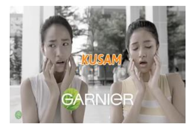
Figure 1. Two women holding her face

In this section, the researcher will explain about Garnier Light Complete Brightening Foam advertisement using semiotic stages, namely denotation and connotation.