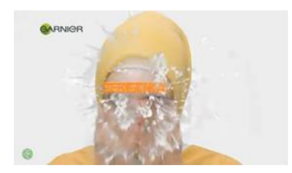
Figure 3. A woman washing her face

The denotative meaning of the second scene or the second picture is showing three women holding oranges. While the connotative meaning of the scene shows that Garnier Light Complete Brightening Foam contains vitamin C which is believed to lighten the skin, like oranges which contain vitamin C.