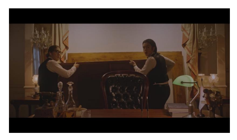
Figure 1. The theft of the original Raden Saleh painting at Permadi's house