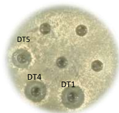
Figure 3. Visualization of the antifungal activity of bioactive compounds from isolates DT1, DT4 and DT5.

Based on the results of profile matching of phenotypic characters between the selected bacterial isolates and the reference bacterial genus, it is known that these bacteria are similar to two genera, namely Bacillus and Pseudomonas . The results of profile matching of three bacterial isolates with 2 reference genera are shown in Table 4.