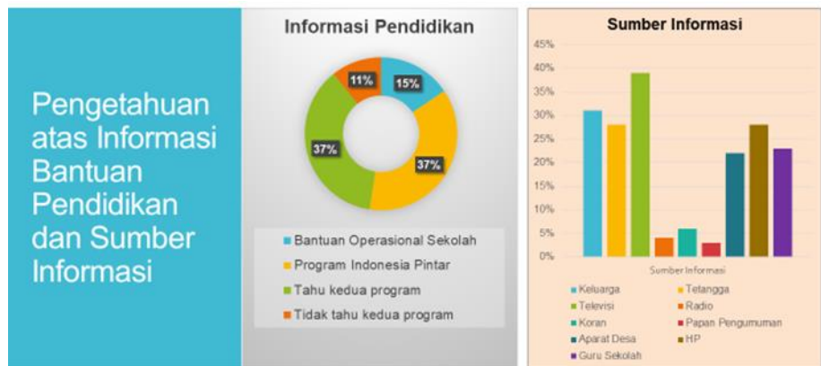
Figure 4 Knowledge of Education Assistance Information & Information Sources

Respondents' knowledge about the two Scholarship Programs, namely the 3T Featured Scholarship program and the Community Achievement Scholarship program, are not owned by almost half (46%) of respondents. At the same time, the rest stated that they knew there were a Community Achievement Scholarship program (37%) and the 3T Featured Scholarship program (7%) and 12 % of the respondents stated they did not know any of them. The source of information is almost the same as the information on education assistance, mostly obtained through television, families, village officials, neighbors, and school teachers. While newspapers, radio, and bulletin boards are used very little as sources of information, particularly mobile phones, they are hardly used to find scholarly information.