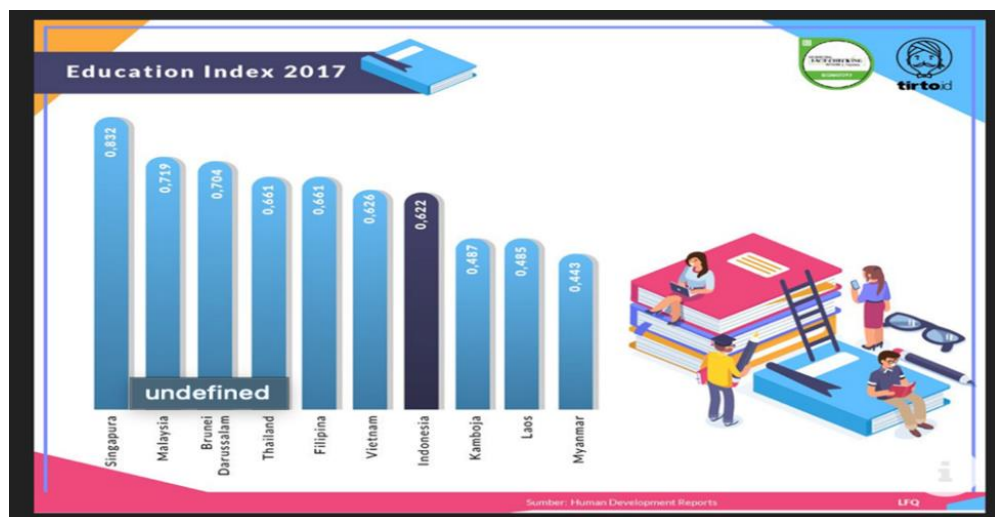
Figure 1 Education Index 2017 Quoted

The changes in the economic situation are indeed fundamental and essential for the local government and especially the community, without having to ignore other substantial things that need attention from the Pangandaran Regency Government, such as the education sector. It is in line with the reality of the Education Index issued by Human Development Reports in 2017, Indonesia ranked seventh among ASEAN countries. It shows that Indonesia's human resources competitiveness is still low compared to Singapore, Malaysia, etc.