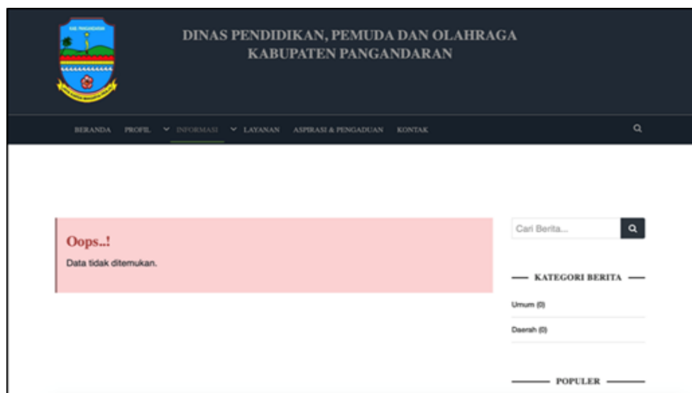
Figure 3 Lack of Education Information Displayed on The Official Page of The Education