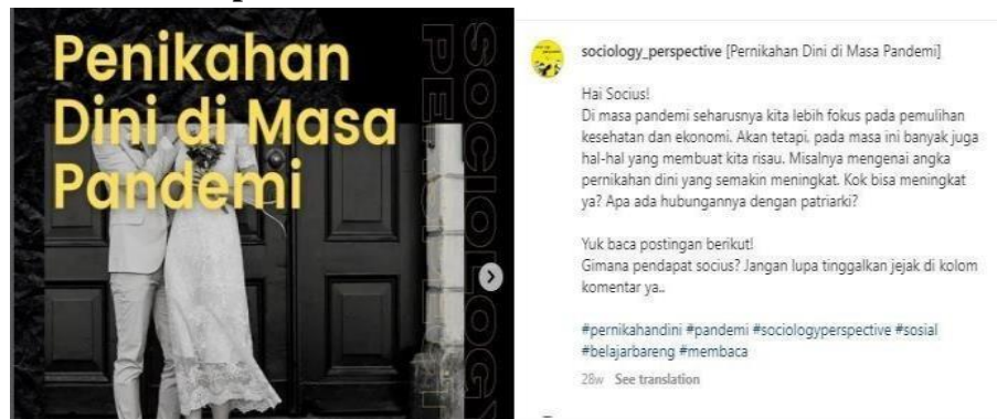
Figure 1. Depiction of an Event in the Form of Feeds