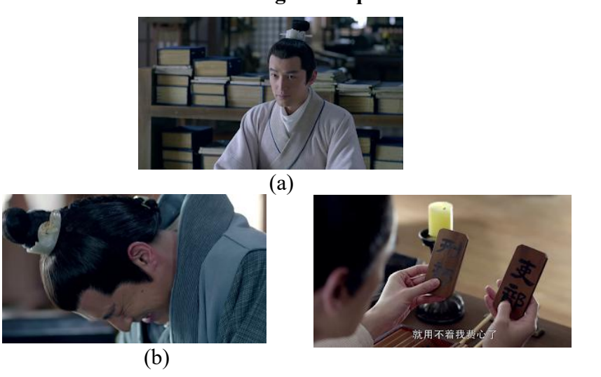
Figure 8. Some shooting techniques

In the shooting technique for scenes that were centered on the protagonist Mei Changsu using medium shot, it showed Mei Changsu's upper half, and here the audience was engaged to just know the object by slightly representing the scene where the cameraman's direction was (Figure 8a).