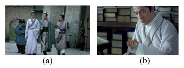
Figure 4. Scene representing the concept of Zhi

The concept of xìn (honesty, righteousness, or loyalty) is the other main virtuous value in Confucianism that up holds honesty, expresses righteousness, and keeps promise. Honesty or loyalty is considered by Confucius as the basis in interpersonal communication and to regulate and manage community and state. The representation of xìn value refers to loyalty in the moral principles and social rules, such as towards superior, subordinate, friend, and business partner. The representation of the concept of xìn in Mei Changsu in reality can be observed in Figure 5, when Mei Changsu still used the name Lin Su, falling into the cliff immediately after he slipped off from his father's grip, and just before he fell off into the cliff he hears his father's words, that was to keep alive and defend Chinyan Clan's good name.