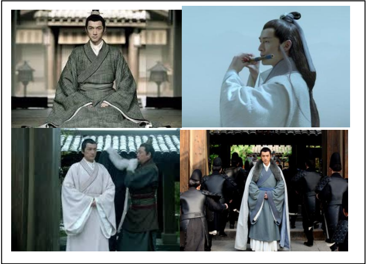
Figure 1. Mei Chang Su's appearance in some conditions

Based on appearance aspect, the protagonist Mei Changsu was represented as an individual with contrast between physical and spiritual appearances. Spiritually, Mei Changsu was represented as an individual with extreme intellectual proficiency, and by cognition he was very smart, as proven that he became the leader of martial art alliance Jiangzuo and ranked first in Langya (Episode 1). Physically, however, he had bad body condition (frequently getting ill, thin and fragile), caused by the toxin in the torment incident 12 years back.