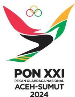
Figure 5. Main news image with title " KONI Jawa Barat Bersyukur Bisa 'Hatrick' Juara Umum PON 2024 "

News headline: KONI Jawa Barat Bersyukur Bisa 'Hatrick' Juara Umum PON 2024 (West Java's National Sports Committee of Indonesia Grateful for the Overall "Hatrick" Champion at PON 2024)