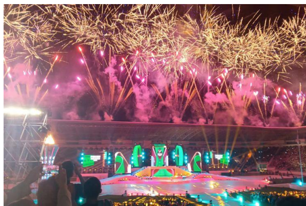
Figure 3. Main news image with title " Penutupan PON XXI, Jawa Barat Catat "Hatrick" Juara "

News headline: Penutupan PON XXI, Jawa Barat Catat "Hatrick" Juara (PON XXI Closing, West Java Records Champion "Hatrick")