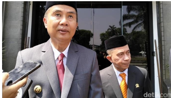
Figure 6. Main news image with title " Bey Sebut Jawa Barat Juara Umum PON XXI Aceh-Sumut "

News headline: Bey Sebut Jawa Barat Juara Umum PON XXI Aceh-Sumut (Bey mentions West Java as the overall champion of PON XXI Aceh-North Sumatra)