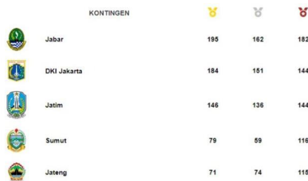
Figure 4. Main news image with title "Jabar Juara Umum PON XXI 2024, Kadispora Ungkap Strateginya"

News headline: Jabar Juara Umum PON XXI 2024, Kadispora Ungkap Strateginya (West Java Won the Overall Champion of PON XXI 2024, Head of the Provincial Youth and Sports' office Revealed the Strategy)