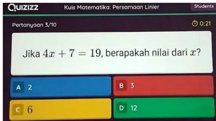
Figure 3. Quizizz Item for Formative Math Assessment

questions and immediate feedback features, the platform enables teachers to quickly identify students' misconceptions and adjust their instructional strategies accordingly. The artifact illustrates how pre-service teachers utilized digital platforms not only to deliver assessments but also to support ongoing formative evaluation in mathematics learning.