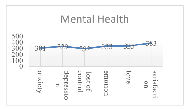
Figure 1. The Total Score of the Adolescent's Mental Health Indicator

Based on Figure 1, the satisfaction indicator has the highest total score of 383, showing that the youth at the orphanage feel relieved or satisfied with themselves and in solving their problems. At the same time, the indicator of losing control has the lowest total score of 292, meaning the teenagers can control their problems due to several factors, as expressed by The Administrator that the orphanage has a program for teaching the value of Sufism in studies after dawn and sunset by foster parents or musrif/musrifah (foster parents' assistants). In addition, the parenting pattern of the orphanage management and foster parents is sufficient for the needs.