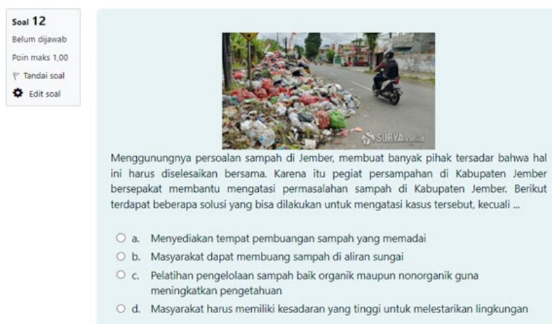
Figure 2. Examples of Digital Assessment Multiple Choice Question Types

Dimensions of scientific literacy that have been determined by PISA, namely the dimensions of knowledge, context, competence, and attitudes. The type of questions used in Digital Assessment consists of examples of scientific literacy questions with multiple choice types. The effectiveness of the Digital Assessment is the result value obtained through working on scientific literacy questions in https://digitalassessment.moodlecloud.com/login . Assessment interpreted into 3 categories low, medium, and high. The examples of scientific literacy questions with multiple choice types are as follows.