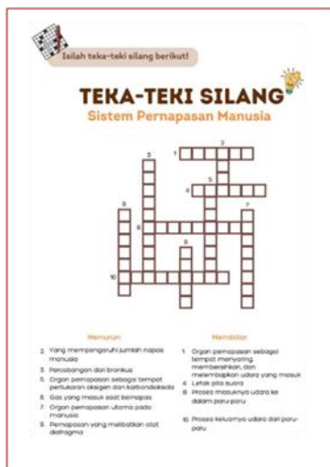
Figure 5. Differentiation of audio-visual learning style processes

Students with audio-visual learning styles are given the task of answering crossword puzzles by listening to explanations in learning videos. Here is an overview of the tasks given, is presented in figure 5.