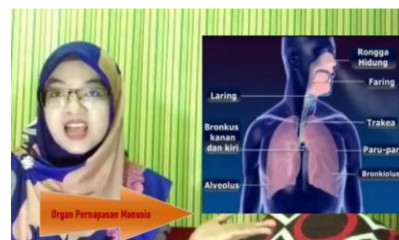
Figure 2. Differentiation of audio-visual learning style content

Students with kinesthetic learning styles, the format of delivering the material is given by providing a barcode containing a video of learning material on the human respiratory system. In addition, students also imitate the movements in the video by exhaling on the mirror surface to find out what happens. Here is a picture of the barcode and a picture from the video clip, is presented in figure 3.