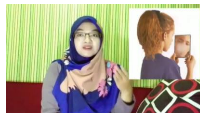
Figure 3. Differentiation of kinesthetic learning style content