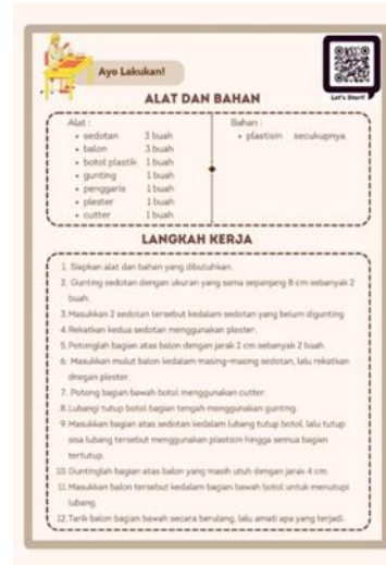
Figure 6. Differentiation of kinesthetic learning style processes

Learners with a kinesthetic learning preference are given the task of making teaching aids based on the text provided in the image below, is presented in figure 6.