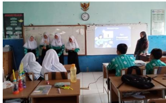
Figure 7. Differentiation of visual, audio-visual, and kinesthetic learning style products

Product differentiation at the first meeting was done by presenting the assignments that had been given according to learning styles. Students with visual, audio-visual, and kinesthetic learning styles presented the results of their assignments, here is the documentation, can be seen in the figure 7.