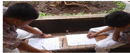
Figure 2. Activities on the ITCPS model class

through investigative activities outside the classroom.