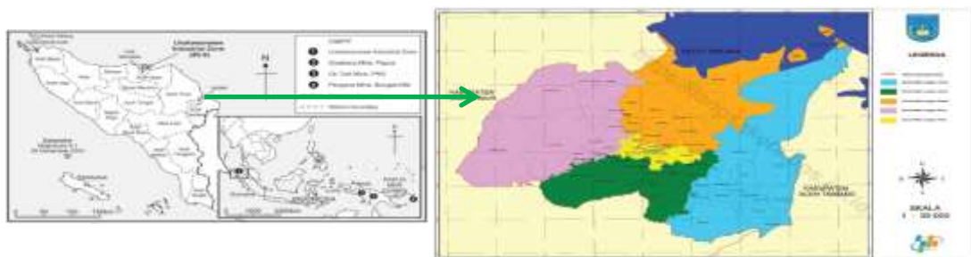
Figure 1. Map of Langsa City, Aceh, Source: McCarthy, John F. (Langsa, 2020; McCarthy, 2007)

The study was conducted for 6 months in Langsa city, Aceh province, Indonesia. This study uses a qualitative approach. Data were obtained by conducting observations, in-depth interviews, and documentation studies. Observations were made by visiting historical and cultural heritages in the Langsa city area. Some of the locations observed were: Balee Juang building, PDAM Langsa tower, Istiqamah Mosque, Tjut Nya' Maneh house. In addition, the researchers also observed the cultural traditions of the Langsa people which are still practiced today, such as: Kuda Kepang, khanduri maulid, khanduri sea, khanduri blang, and rewang. In-depth interviews were conducted using purposive sampling to collect data on the participation of the city government, villages and communities in realizing history-based sustainable tourism in the city of Langsa, Aceh.