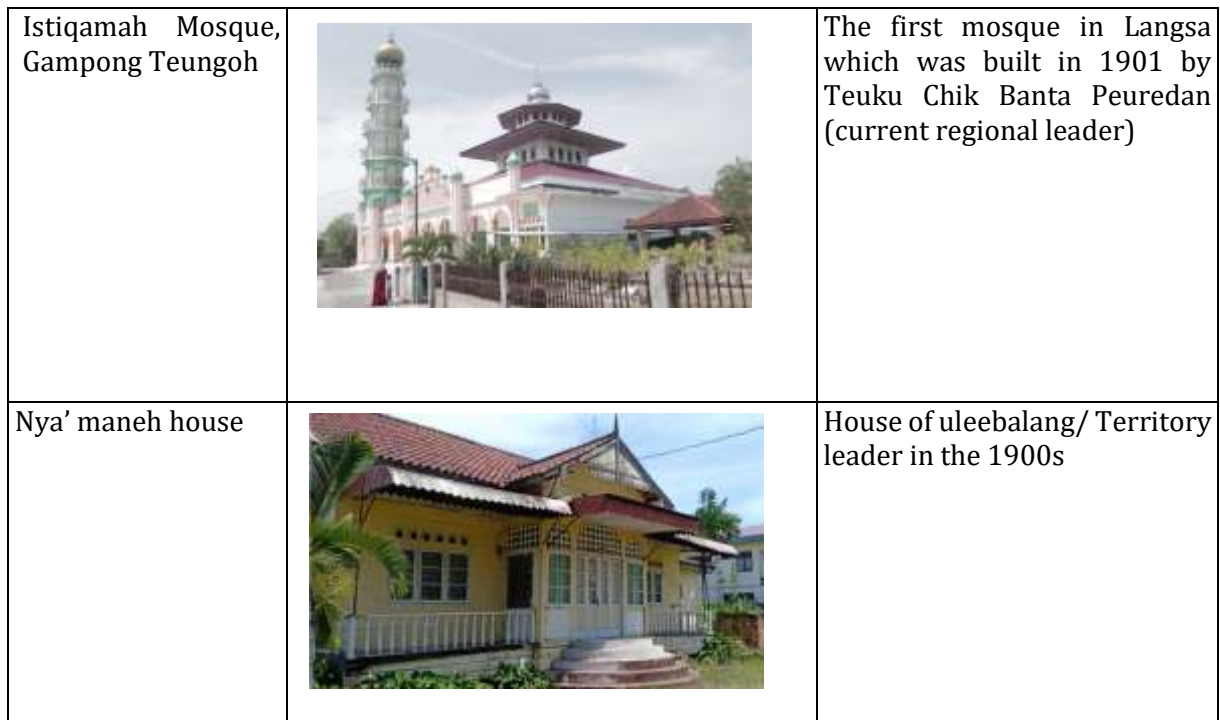
Table 1: Physical Heritage

Many non-physical relics are also found in Langsa. As an area with a multiethnic society, Langsa holds many cultural relics such as oral traditions about the history of the founding of villages in Langsa, the cultural behavior of multiethnic communities in Langsa, so that attitudes and consensus emerge that the Langsa people live and build a harmonious, peaceful, social life. and harmonious without prioritizing differences. Cultural transformation with subcultures of art, tradition, language and customs can be carried out in its entirety and create a harmonious life, which prioritizes inter-religious harmony. So that each village in Langsa is unique because each village has a distinctive ethnic style. There are villages that have Acehnese, Javanese, Minangkabau, Chinese, and Mandailing cultural characters.