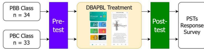
Figure 1. Research Design and Process

Education Class of C) was 33 students. This research was conducted from September to November 2023 at Universitas Negeri Surabaya. The sampling technique used was random cluster sampling because the university randomly chose the class.