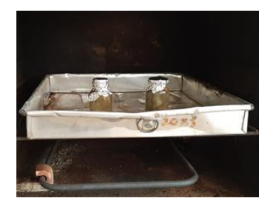
Figure 2. Heating oil

them in an oven at a temperature of 2500 \text{ }^{\circ}\text{C} for 3 hours can be seen in Figure 2.