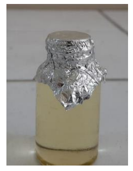
Figure 3. Corn oil C-dots

The long heating process will increase the saturation of fatty acids in the oil. Saturated fatty acids have more carbon bonds than unsaturated fatty acids, so the number of broken carbon chains and C-dots particles is also increasing. The abundant content of carbon chain bonds in oil is the basis for making C-dots. The carbon chain bonds abundant in oil are easily broken due to the process and undergo heating the rearrangement of carbon chains to form particles. The oil sample after being in the oven can be seen in Figure 3.