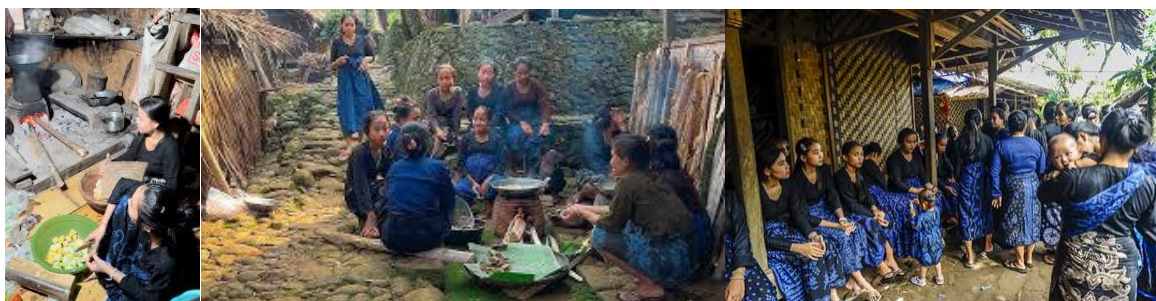
Figure 4. Family interaction as a medium for transmitting customary values and social norms

This statement illustrates that learning within the Baduy community prioritizes moral values and cultural integrity.