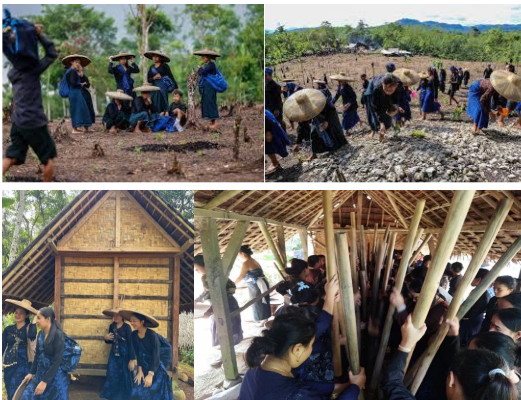
Figure 2. Children participating in farming activities alongside their parents as a form of experiential and intergenerational learning

These statements indicate that learning is acquired through direct participation rather than explicit instruction.