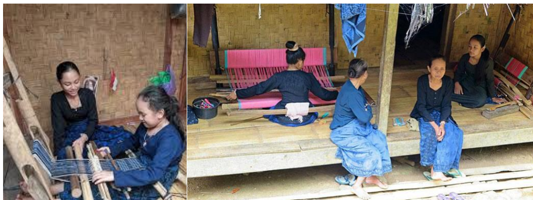
Figure 3. Intergenerational transmission of weaving skills through observation and guided participation

Evidence from Participant Observation, participant observation revealed that children frequently accompanied their parents to agricultural fields. During farming activities, children observed planting techniques, land preparation, and crop maintenance. Researchers observed that adults rarely provided formal explanations. Instead, children learned through repeated observation and involvement in routine activities. In weaving activities, young girls were observed sitting beside older women and gradually imitating weaving techniques. Learning occurred informally through participation and practice rather than through structured teaching.