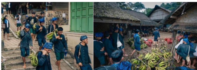
Figure 6. Participation in cultural practices as a form of literacy development

Evidence from Participant Observation, researchers observed frequent storytelling activities within family settings. Oral narratives were used to communicate customary values, environmental knowledge, and social responsibilities. Children demonstrated an understanding of community norms, cultural symbols, and traditional practices despite limited exposure to formal literacy instruction.