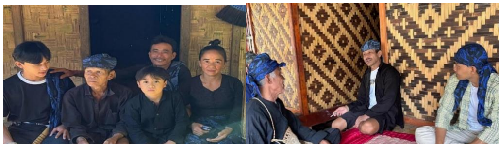
Figure 5. Oral storytelling as a family literacy practice within the Baduy community

“Anak belajar dari cerita orang tua, dari apa yang dilihat setiap hari, dan dari ikut kegiatan adat.”