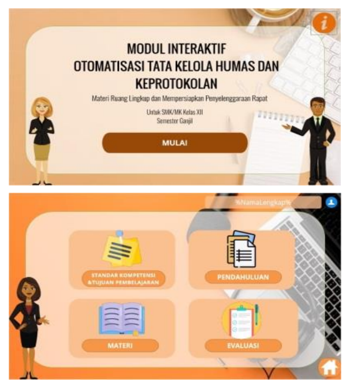
Figure 2. E-MODULE HOME PAGE AND MAIN MENU DISPLAY

The next stage is Design, this stage is carried out designing the appearance and content of the product from defining the problems that exist at the analysis stage. This design starts from developing material that is adjusted to the 2013 curriculum syllabus and the needs of students. After that, create a storyboard design that can be used as a reference material for creating e-modules in Articulate Storyline 3.