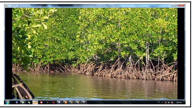
Figure 3. Mangrove ecosystem in Torosiaje village, Gorontalo, the residents of Sea Bajo Tribe.