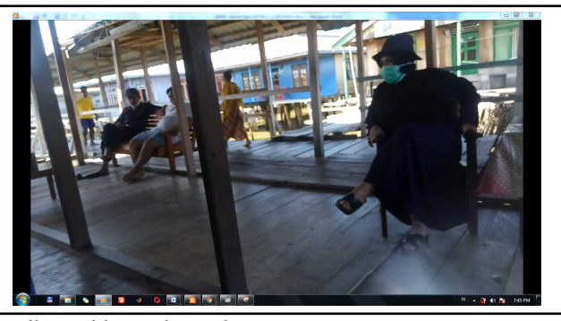
Figure 2. Gorontalo Bajo Tribe residents above the sea.