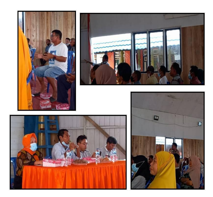
Figure 4. Discussion Session during asynchronous workshop.