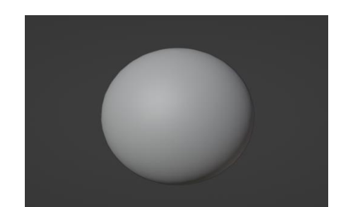
Figure 3 Result of Design 3D Object Using Blender

The objects designed in the Blender application are 42 atoms that make up each compound in the form of a molecule and 1 stick as a bond for the atoms for each compound. The length of the ties made is 30 mm with a diameter of 2.8 mm. This is so that the bond stick can be seen clearly. List of atomic sizes refers to ChemLibre [25].