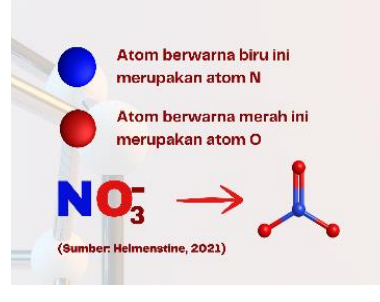
Figure 1 One of Result of Design of NO<sub>3</sub><sup>-</sup> using Canva

At this stage, Canva is used as a designer of 2D objects and animated videos. At this stage, Canva is used as a designer of 2D objects and animated videos. Canva has limitations, namely that it cannot create 3D effects or models, so its use is limited to 2D and video. The 2D object designed is a card explaining the color of the atomic balls of each compound. The object is then input into Assemblr Studio as a complement to the final object in the barcode.