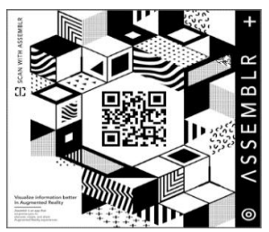
Figure 4 One of Barcode of Molecular Shape in Product

The results of the design and preparation of the final object in Assemblr Edu are published in the form of a barcode which will be scanned by students using one of the AR applications, namely Assemblr Edu. Barcode Assemblr Edu which is a complement to interactive LKPD products. The following is an example of Assemblr Edu barcode results in an interactive LKPD product.