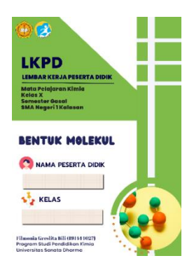
Figure 5 Result of Design Product in Canva

illustrations in template form so that they can be used immediately. Apart from that, there are also font types and various other features to support creativity in creating product designs [27]. Designing interactive LKPD products in Canva starts from the front cover to the references by utilizing various template features, images that are appropriate to the topic of molecular shapes. LKPD product components that have been designed are saved in PDF form.