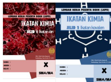
Figure 2. Validity Construct of Student Worksheets

Below is the example of student worksheets content that has been validated as content validity