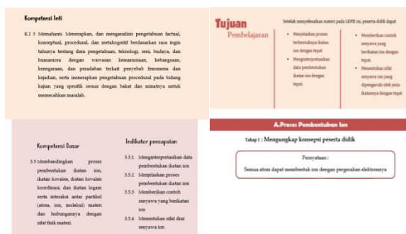
Figure 1. Validity Content of Student Worksheets

Below is example of student worksheets content that has been validated as content validity