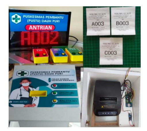
Figure 3. Tool Implementation Digital Queue Prototype

3. Press one of the push buttons found on the digital queuing tool according to the service that the health center patient will go to