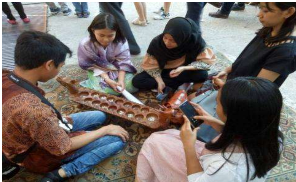
Figure 2. congklak game https://images.app.goo.gl/88aBkRp2QSncKUcx7

Congklak, also known as dakon in some regions of Indonesia, is a traditional game that has been passed down from generation to generation. This game involves a perforated board and small seeds as game tools 2022. In a cultural context, congklak is not just entertainment, but also a means of learning and preserving traditional values. The image of someone playing congklak is a symbol of cultural harmony and social interaction that is rich in meaning. This game is not only a means of entertainment, but also a medium for preserving tradition, learning strategies, and building character. Therefore, it is important for us to continue to preserve and introduce congklak as one of the cultural assets of the Indonesian nation.