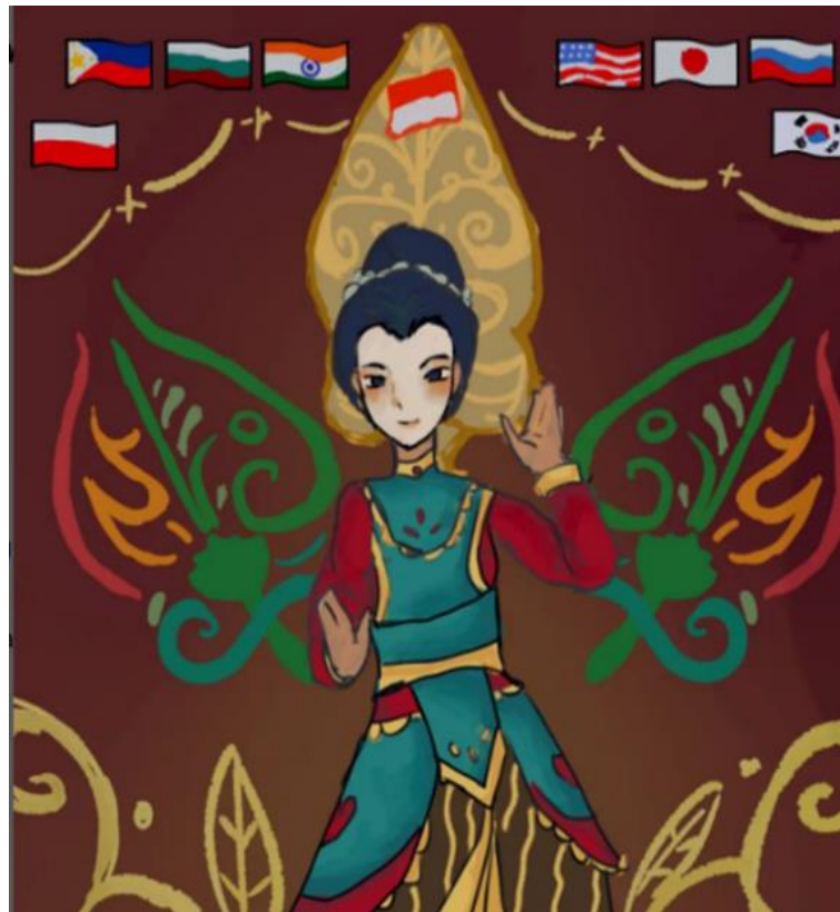
Figure 2. Illustration of the Thengul Dance

Thengul Dance: This dance is a development of the thengul wayang art and displays dynamic movements that depict the life of the people of Bojonegoro. Thengul dance is usually performed in cultural events and traditional ceremonies.