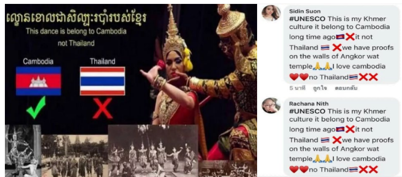
Figure 2. Cambodian Facebook users rage over dance Khon ownership

Kol performance art form in Cambodia which both have roots in the Hindu epic Ramayana, although there are also differences in the interpretation of each story in the two performance arts. Meanwhile, the Songkran Festival is also very closely related to the culture of the Cambodian people, who celebrate the Buddhist calendar new year with the expression of splashing water. Therefore, there is a fear of the Cambodian people losing their cultural elements, if the two cultures have already been registered to UNESCO by Thailand. Below are news snippets of news responses related to this issue.