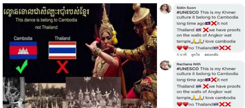
Figure 2. Cambodian Facebook users rage over dance Khon ownership

Kol performance art form in Cambodia which both have roots in the Hindu epic Ramayana, although there are also differences in the interpretation of each story in the two performance arts. Meanwhile, the Songkran Festival is also very closely related to the culture of the Cambodian people, who celebrate the Buddhist calendar new year with the expression of splashing water. Therefore, there is a fear of the Cambodian people losing their cultural elements, if the two cultures have already been registered to UNESCO by Thailand. Below are news snippets of news responses related to this issue.