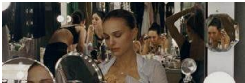
Balerina's dressing room

The ballerinas dressing room reflects the competition and ambition of the performers to perform their best in the Swan Lake performance. In the dressing room provides an intimate view into the competition among ballerinas, including Nina and Lily and the pressure they feel to maintain or enhance their reputations.