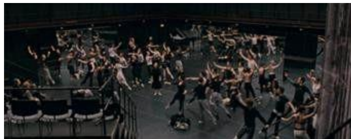
Ballet Studio in New York City