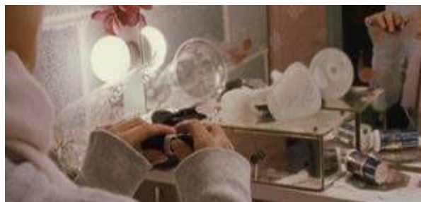
Nina taking Beth's makeup without her permission (00:12:25)

The events that illustrate Nina's ambition are practicing hard until late at night. She practiced late at night because she doubted herself and was still trying to reach her ambition as the Black Swan. Previously, during the rehearsal, Nina was accompanied by a piano player, but soon the piano player rushed home. Nina practiced hard until late at night to play the role of the Black Swan to the fullest.