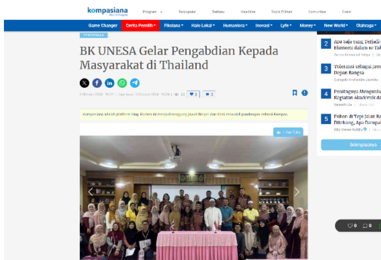
Figure 4. PKM Activities are Published in Electronic Media

This PKM activity not only leads to training but also builds a strong foundation for the creation of a harmonious and inclusive school environment. Evidence of PKM's output, both in the form of articles and visual media, underlines the success of the activities and contributions that have been given to Sangkhom Islam Wittaya School in facing the challenges of cultural diversity in the educational environment.