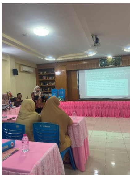
Figure 2. Implementation of PKM

In addition, participants were also introduced to various strategies to create an inclusive and harmonious learning environment, which can support the academic and social progress of students from different cultural backgrounds. Guidance and Counseling (BK) programs that are responsive to cultural diversity are the main keys in creating a learning environment that supports and unites different students.