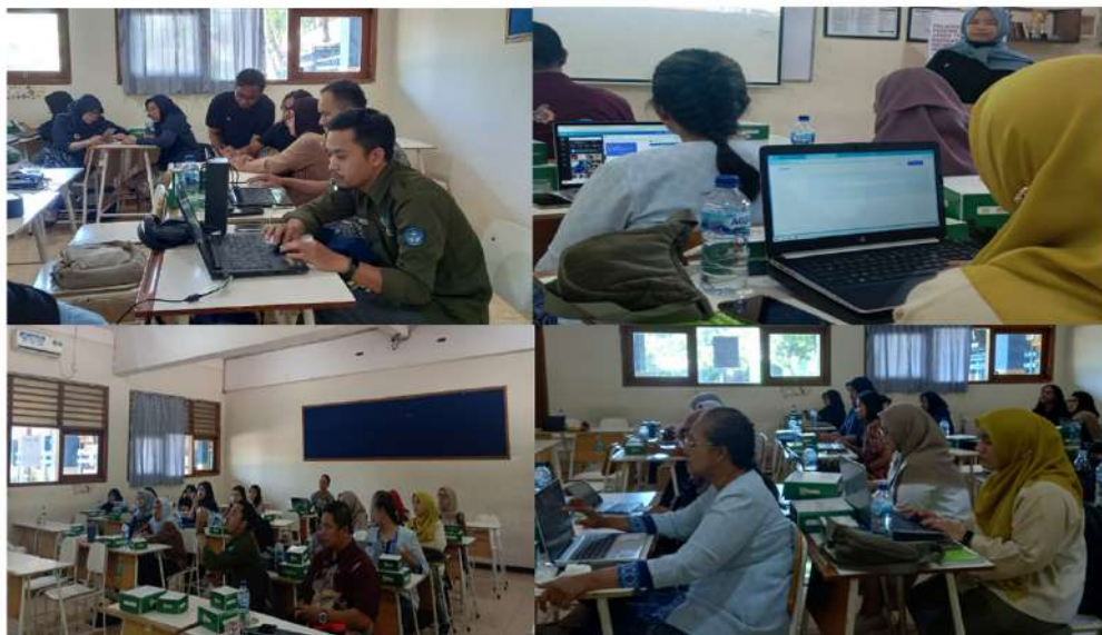
Figure 7. Training Process

In addition to using AI applications for design, educators can enhance the interactivity of their cultural posters by incorporating multimedia elements. Some AI platforms, such as Canva Pro or Piktochart, allow for the inclusion of QR codes that link to external resources like videos, audio clips, or interactive quizzes. For example, a poster about East Javanese traditional music could feature a QR code that directs students to a video of a live performance, accompanied by German-language subtitles or explanations. This approach not only enriches the learning experience but also promotes active engagement, encouraging students to explore the cultural material beyond the classroom setting while simultaneously improving their listening and comprehension skills in German.