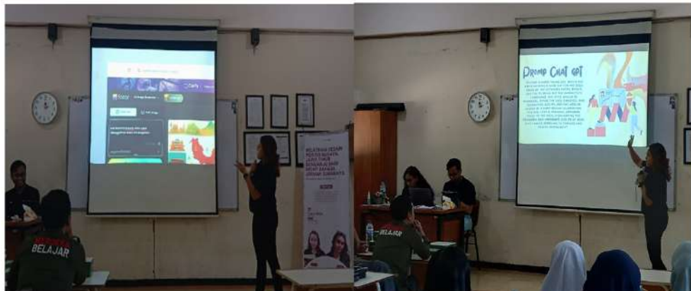
Figure 5. Presentation of the Second Speaker

The second session introduced participants to AI tools. Several AI applications and websites can be effectively utilized for educational purposes, particularly in creating cultural posters for German language learning. Platforms like Canva, Fotor, Piktochart, and Design.com offer AI-assisted design tools that simplify the creation of visually engaging materials. These platforms allow users to generate high-quality graphics, select from a wide range of templates, and incorporate AI-generated elements such as icons, backgrounds, or images. In German language instruction, teachers can use these tools to design posters that highlight cultural elements from East Java while incorporating German vocabulary. For instance, using ChatGPT alongside these design tools can help teachers craft relevant text or captions in German, ensuring linguistic accuracy while visually presenting cultural themes.