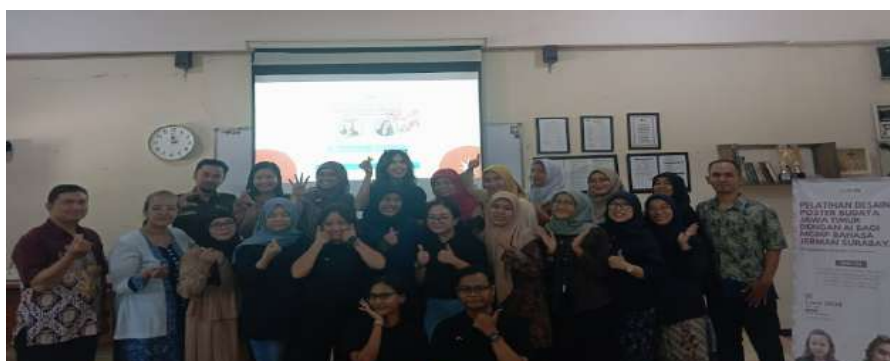
Figure 9. The Closing of Training