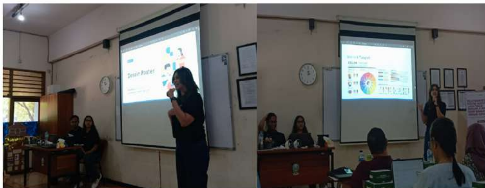
Figure 3. Presentation of the First Speaker

The first session introduced participants to several types of posters, each designed for different purposes and audiences. Promotional posters are used to advertise products, events, or commercial services by including important information such as product features, pricing, event dates, and locations. Educational posters aim to deliver knowledge or information on specific topics, such as health, the environment, or academic subjects, using visual elements like images and data visualizations. Campaign posters focus on raising awareness of social, political, or environmental issues to mobilize public support. Artistic posters serve as visual artworks that express creativity and aesthetic elements, often utilizing unique and experimental designs. Additionally, scientific posters present research findings visually and are typically used in academic settings. Lastly, cultural posters highlight themes of local culture, traditions, and heritage, aiming to promote diversity and foster greater appreciation for cultural identities.