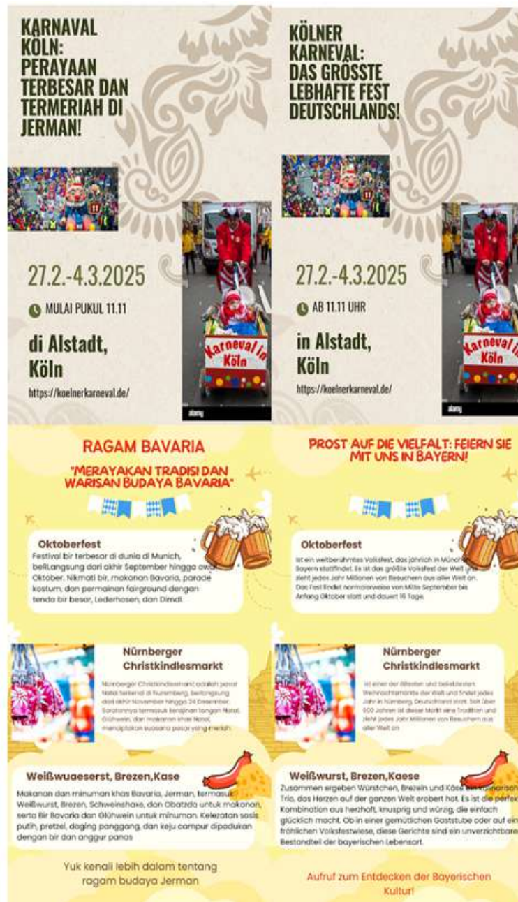
Figure 8. Examples of AI-assisted Cultural Posters