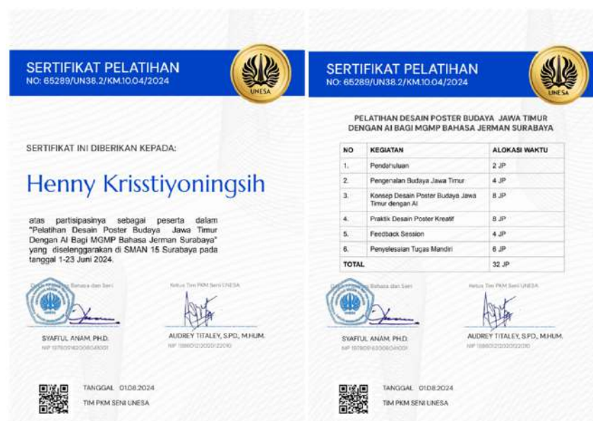
Figure 10. Certificate of Training Completion

During the third stage, the feedback session and evaluation, the community service team supported participants in finalizing their cultural posters, which focused on East Javanese culture. A Zoom meeting was conducted to provide feedback on the posters, which were created by participants in both Indonesian and German. After submitting their final poster designs, participants completed a questionnaire to assess the effectiveness of the training. The feedback session, along with examples of the participants' cultural posters and the evaluation questionnaire. After submitting the posters, the participants received Certificate of Training Completion as in Figure 10 below.