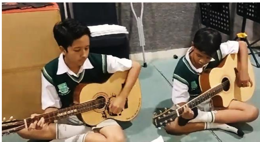
Figure 2. Peer tutoring method training (Author, 2024)

Figure 1 is the process of learning a music ensemble at SMP Regina Pacis Surakarta using a diverse approach oriented towards practical learning. The art teacher uses a demonstration method to provide direct examples of the correct musical instrument playing techniques and the musical elements needed. Students are then given the opportunity to try to practice directly what has been learned so that it can support students' creative exploration. Then, the practice method which is the core of this learning is carried out regularly and in a structured manner to improve musical playing skills, improve coordination between musical instruments, and achieve the desired sound harmony in the ensemble. In the practice process, students are invited to work together, support each other, and collaborate to create harmonious music.