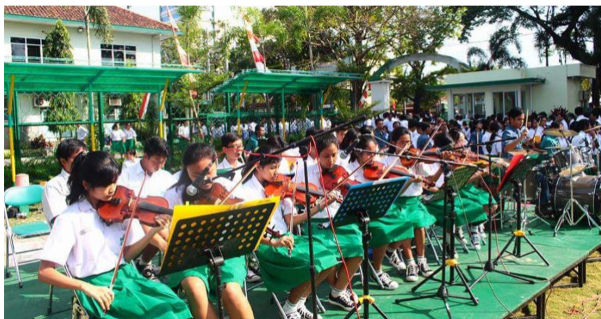
Figure 4. Music Ensemble Performance at the Indonesian Independence Day.

The medley arrangement of folk songs, as shown in Figure 3, contributes greatly to increasing students' interest in Indonesian culture. By combining folk songs such as Dondong Opo Salak, Gundul-Gundul Pacul, and Suwe Ora Jamu in a single arrangement, students are invited to understand the richness of Indonesian traditional music in a relevant and interesting way. The process of incorporation provides a new experience for students, where they can explore musical elements such as Javanese pentatonic scales, dynamics, and harmony, while at the same time enjoying playing music that is full of variety and challenges.