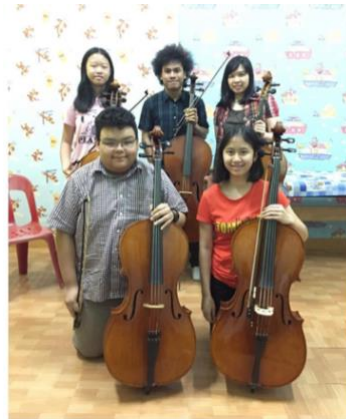
Figure 4. Seraphim Musik Studio Class Design (Author, 2023)

Interior design is planning, arranging, and designing interior spaces in buildings, which function to fulfill basic needs for shelter and shelter, determine and organize activities, and maintain aspirations (D & Binggeli, 2018). This is in line with the studio class design at Seraphim Music Studio. Each studio class has a different decoration design but has several characteristics of musical decoration in the form of paintings, drawings, drawings quotes, and wallpaper that is identical to musical elements or music composers. The following is an example of a musical design in studio class.