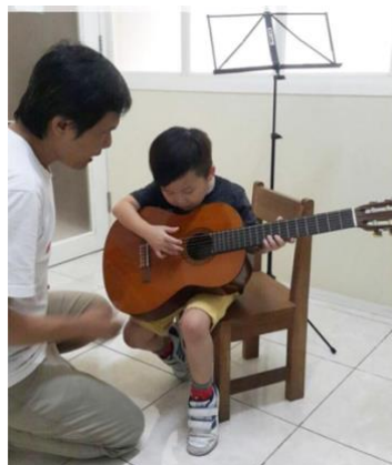
Figure 1. Studio Class Facilities at Seraphim Music Studio

Seraphim Music Studio has standard facilities that must be met. The facilities in the studio class are Seraphim Music Studio's steps in managing the learning environment. The facilities in the Seraphim Music Studio class have 7 standard facilities that must be met, namely AC (air conditioner), Upright Piano, piano chair, general chair, sheet music stand, whiteboard , and metronome manual. The provision of facilities provided by Seraphim Music Studio can attract public attention, especially for students who want to study music. The following is an example of the facilities available in the Seraphim Music Studio class.