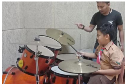
Figure 3. Studio Band Class Facilities at Seraphim Music Studio (Author, 2023)

Band studio classes were developed by Seraphim Music Studio to facilitate students in learning modern musical instruments such as keyboards, electric guitars, electric basses, and, acoustic drums. In this case, the band studio class is very profitable for the management of Seraphim Music Studio, because apart from being rented generally at a rate of 100,000,- / hour. Having a studio band class allows Seraphim Music Studio to attract more students, because not many non-formal music schools, especially those in Surabaya, have complete facilities like Seraphim Music Studio.