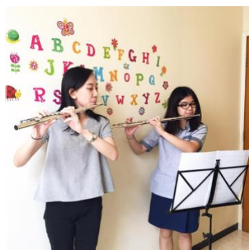
Figure 5. Seraphim Musik Studio Class Design (Author, 2023)

To date, Seraphim Music Studio has collaborated with many social institutions, community organizations, and event organizers in various programs or events, so that Seraphim Music Studio can develop its marketing patterns in a further area, namely towards music performance and music entertainment. The development of this marketing pattern led Seraphim Music Studio to form an orchestra called Seraphim Orchestra.