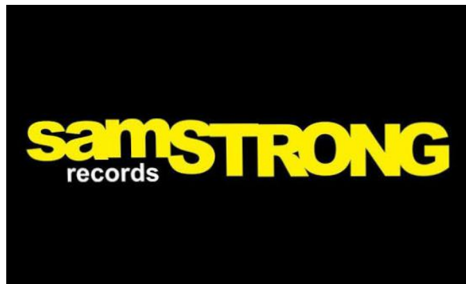
Image of Media Partner at the event