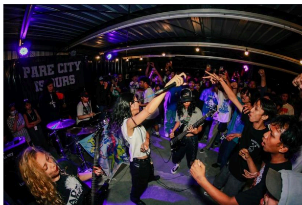
An image showing the enthusiasm of the audience in watching the Brothers Keeper music concert