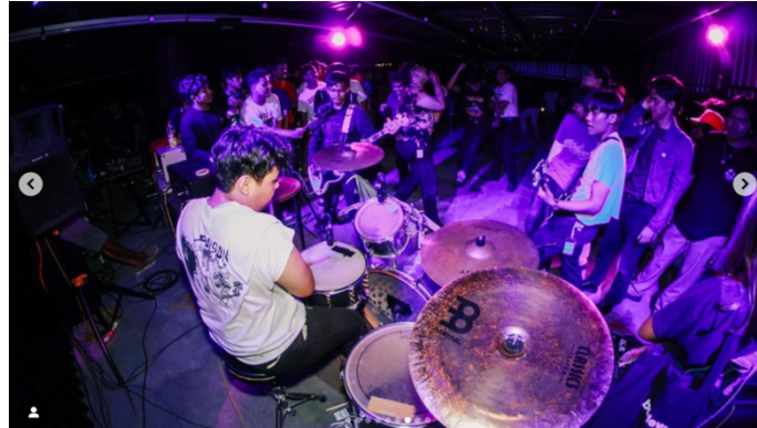
Image of one of the local bands participating in the Brothers Keeper music show by Evolve Worldwide.